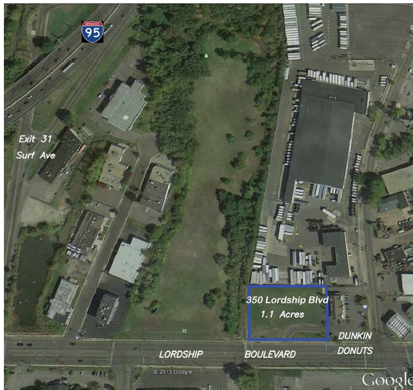
350 LORDSHIP BLVD. 1.13 ACRES